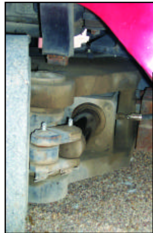
Steer cylinder is completely protected in axle housing.