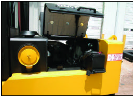
Gull wing hood allows for easy service access to engine compartment and slide-out battery.