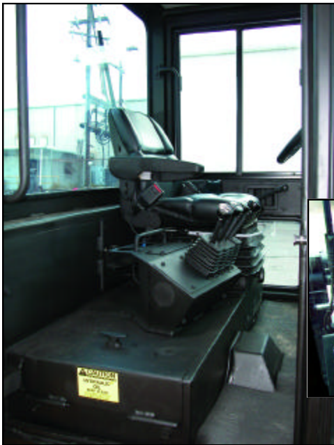
Spacious operator's stations