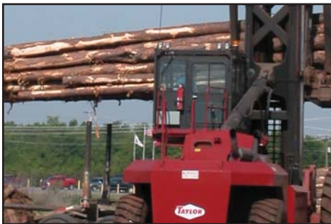
TLS-1000 rear cab view

All models certified to meet ANSI B56.1 FOPS operator protection. Shock mounted, elevated left-hand offset mount operator full cab is standard. Cab is standard with front guard, air conditioner, pressurizer, heater, two defroster fans, front/rear wipers, CB radio, air horn and 10-lb. fire extinguisher. Joystick fingertip hydraulic remote controls for smooth, precise control. Control stand is adjustable. Premium cloth air suspension seat with arm rests reduces vibration and anti-cinch operator restraint allows movement and operator comfort. Tilt steering for operator comfort with fingertip full hydrostatic steering. Hinge down instrument panel and reset circuit breakers makes servicing easy. Convex, wide angle rear view mirrors. Keyswitch-actuated amber strobe light and forward and reverse motion alarm standard. High mounted tilt cylinder for mast stabilization.