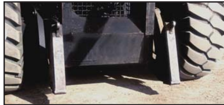
Optional log pushers to improve log stacking