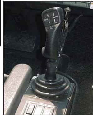
Joystick fingertip hydraulic and electric remote controls for smooth precise control