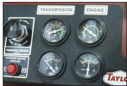
Conveniently mounted gauges and systems warning lights and controls