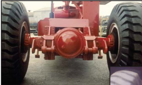
TLS-1000 drive axle