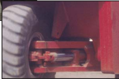
TLS-800 steer axle