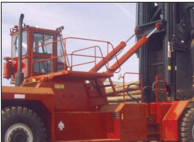
Anti-slip steps and handrails for 3 point mounting and dismounting (meets new proposed ANSI B56.1 standard)