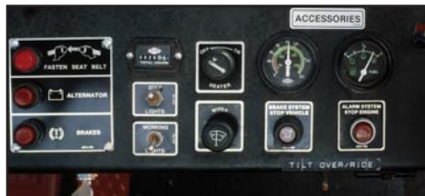
Left side operator panel