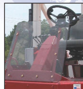
Standard Splash Guard