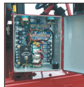
Sealed Electrical Box